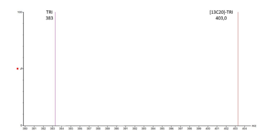
MS spectrum of T2 Triol and standard LIB'UP® U-[13C20]-T2 Triol