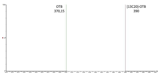
MS spectrum of Ochratoxin B and standard LIB'UP® U-[13C20]-Ochratoxin B